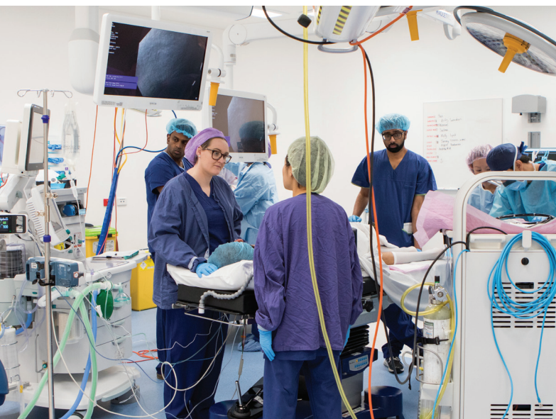
Werribee Mercy Hospital surgical team

Mercy Health's suppliers manufacture or source from manufacturers all over the world. Manufacturing occurs in a number of countries including Australia, the United States of America, Germany, Turkey, Japan, China, Malaysia, Mexico, Columbia and Sri Lanka.